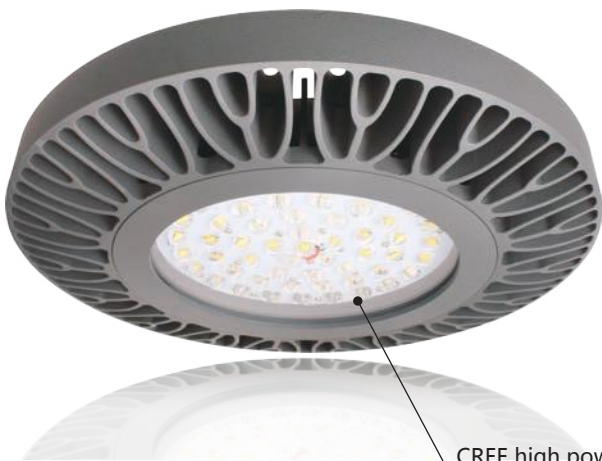
CREE high power XTE