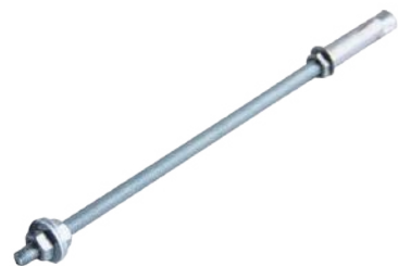
Steel Hanging Rod